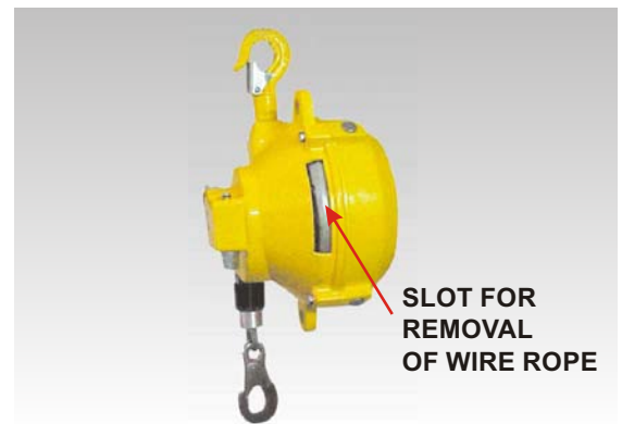
SLOT FOR REMOVAL OF WIRE ROPE