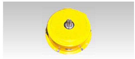
SPRING ASSEMBLY CONTAINER